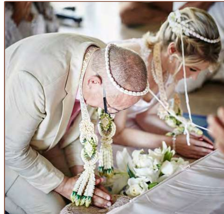
Melati Royal Thai Wedding

'Exchange vows and wedding rings on a secluded beach of powdery sand'