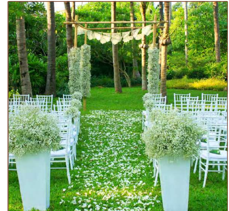
Melati Signature Wedding

Your remarkable day is the most memorable day.